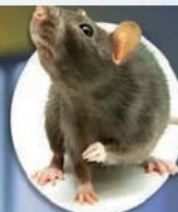
RAT & MICE